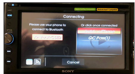
ACP-WL Connection Screen