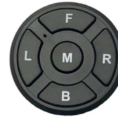
RF Remote Control