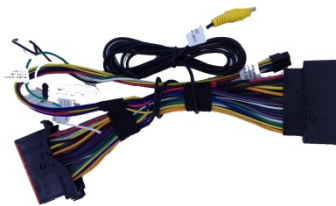
CH-75C HARNESS (2620)