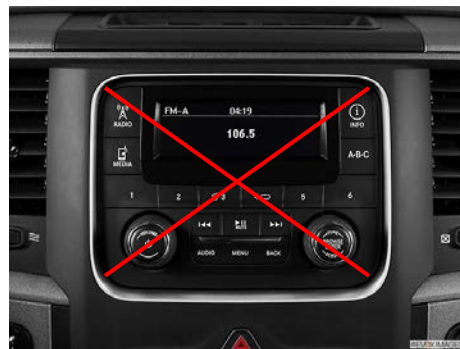
4.3" Screen with 4 Buttons & 2 Knobs