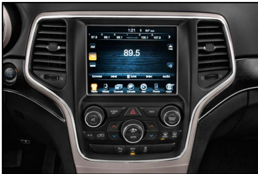
8.4" Screen with Separate Knobs