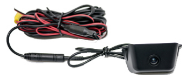
CH-75C CAMERA (CCH-01G)