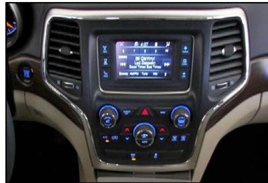
5" Screen with 6 Buttons & Separate Knobs