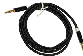
3.5 to 3.5 Cable